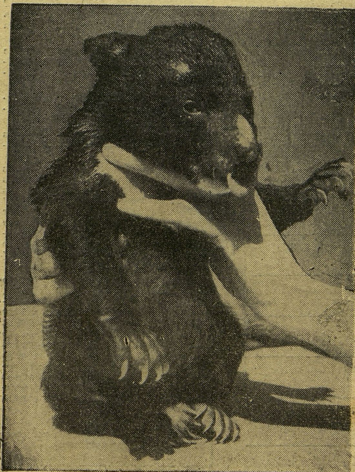
A NEW ARRIVAL. A black Himalayan bear cub presented to the Lahore Zoo by the Urusvati Himalayan Research Institute of the Roerich Museum, Naggar (Kulu).