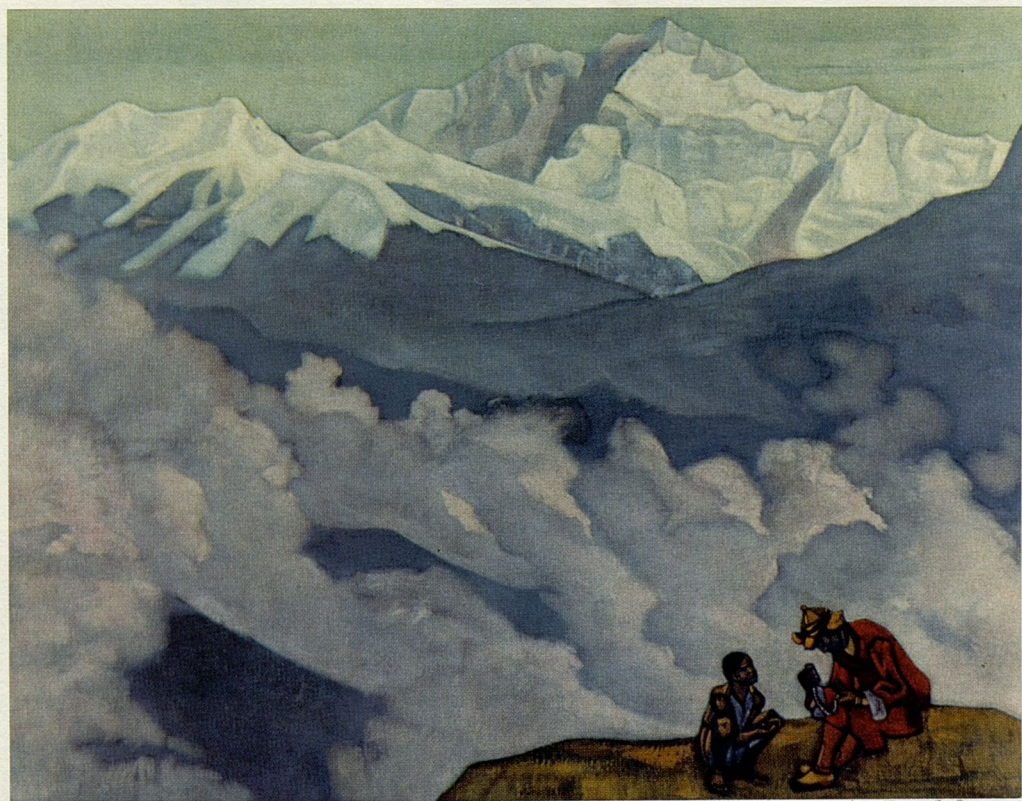
Peak of Searching