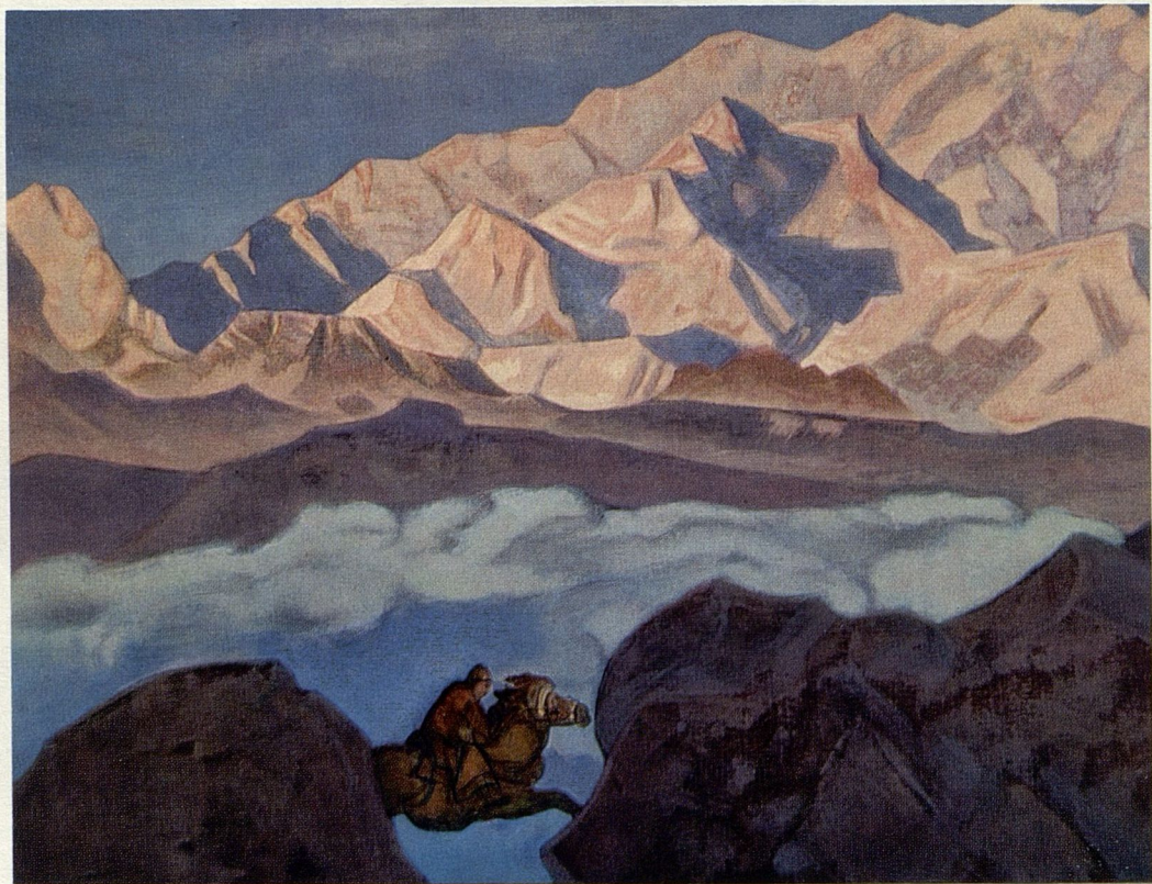
He who hastens