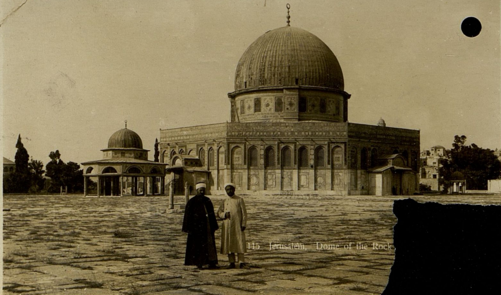
115 Jerusalem, Dome of the Rock