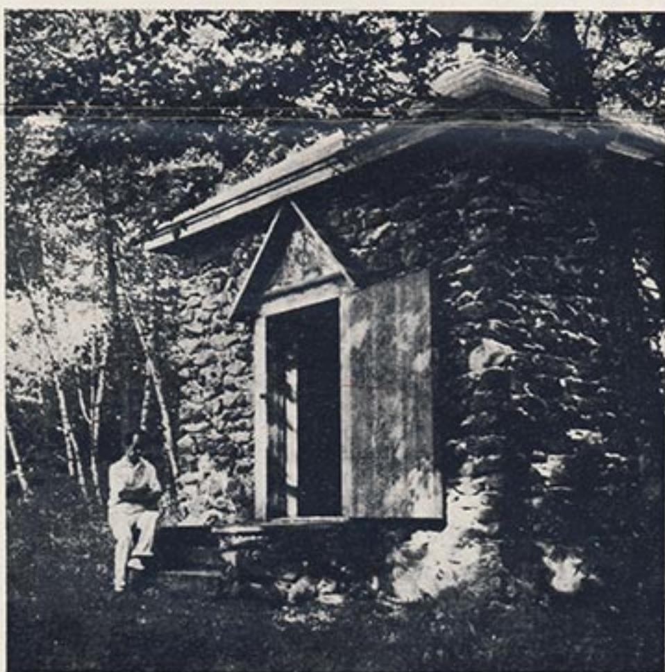
Author at the Chapel in Churaevka Village