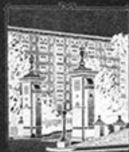
WARDMAN PARK HOTEL WASHINGTON, D.C.