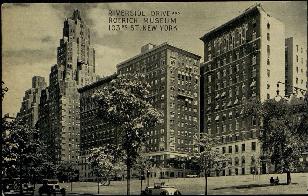
RIVERSIDE DRIVE AND ROERICH MUSEUM 103 RD ST. NEW YORK