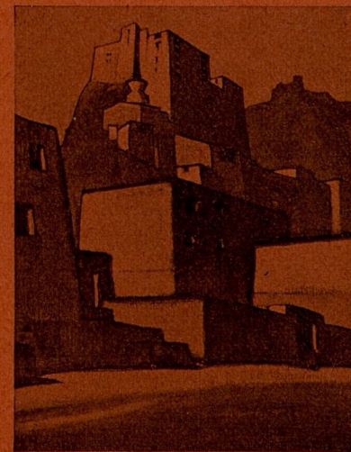
ROYAL PALACE AT LEH