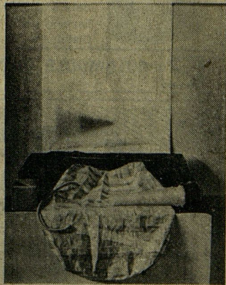
Still Life with a Sack — an exhibit.

She said the first phase of the Art Complex costing Rs. 42 lakh had just been completed.