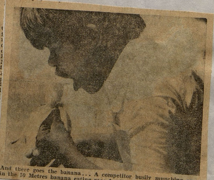
And there goes the banana... A competitor busily munching away in the 50 Metres banana eating race for boys.