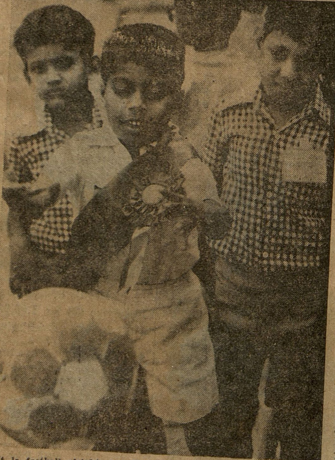
It is football alright...but they were allowed to use their hands!

All the participants were given participation prizes and the winners were awarded medals.