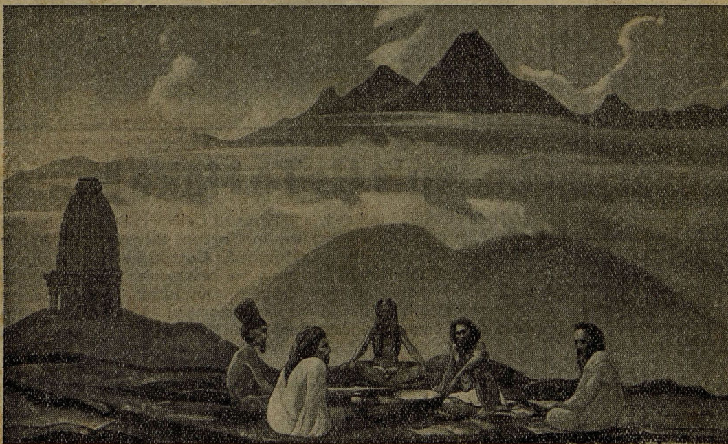
THE SPIRIT OF THE HIMALAYAS. —Photograph of a painting by Svetoslav Roerich, who talks on the subject from Lahore on December 19.

The Lucknow Station, besides the Christmas Eve programme, is putting on the air a special feature entitled "Antim Katha" to be broadcast on December 31.