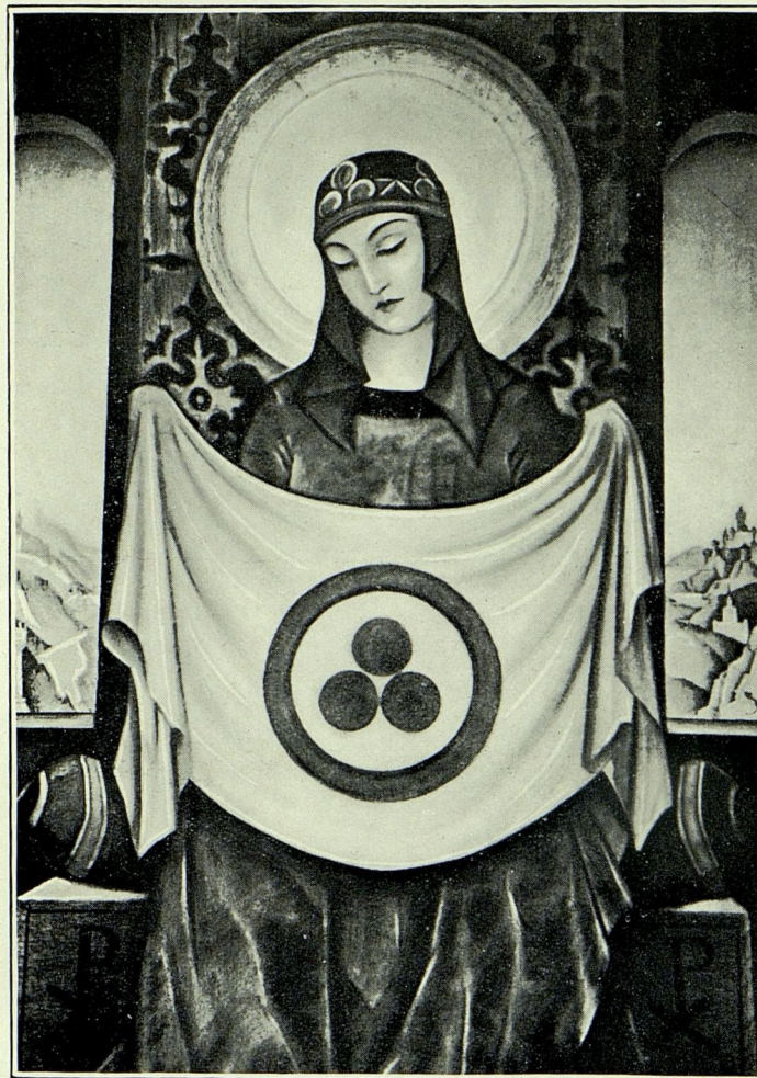
THE GREAT MOTHER OF THE BANNER OF PEACE by NICHOLAS ROERICH.