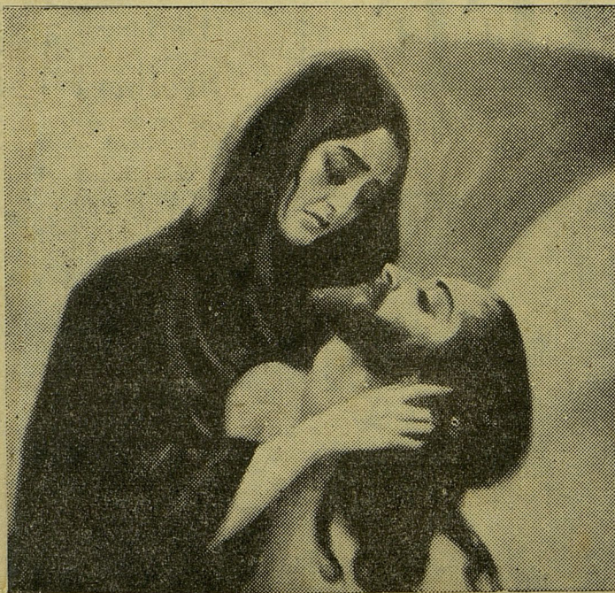
PIETA: Religious themes dominate Svetoslav Roerich's paintings. This one shows the "Mother of Sorrows" holding her crucified Son in her arms.