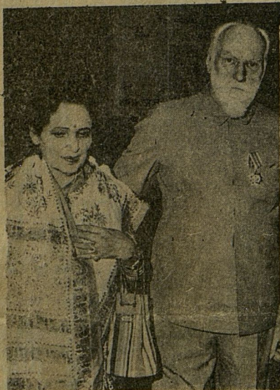
Famous painter Stanislav Roerich (right), who was presented with the USSR's highest award, the Order of Friendship among Nations, on Thursday, with his wife Mrs Devika Rani

Indian recipients of the signal honour have been CPI general secretary C Rajeshwara Rao and veteran freedom fighter Aruna Asaf Ali.