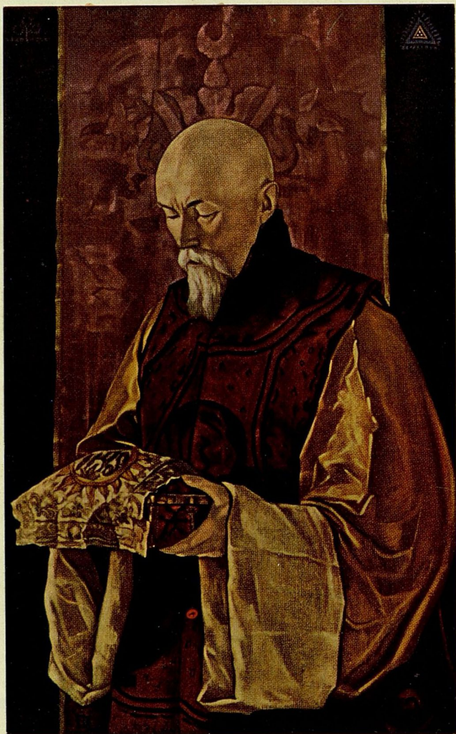
NICHOLAS ROERICH Portrait by Svetoslav Roerich.