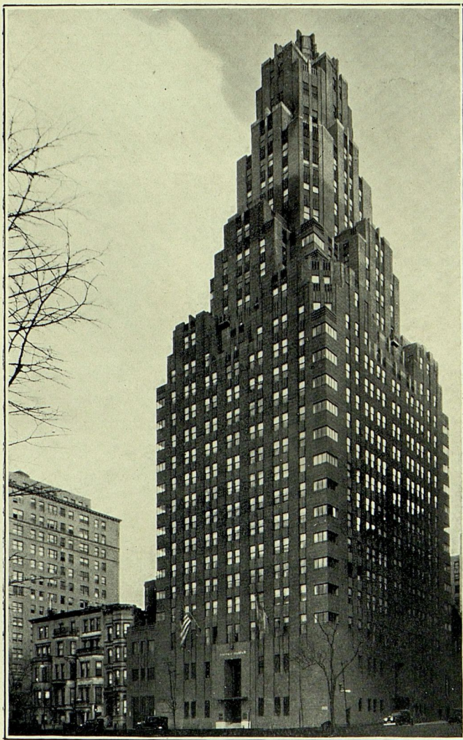
THE ROERICH MUSEUM IN NEW YORK.