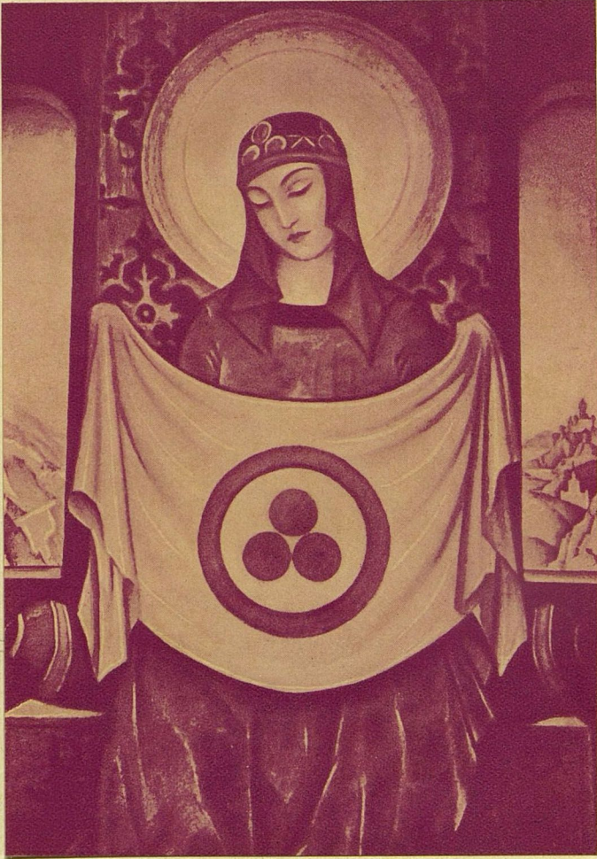
THE GREAT MOTHER OF PEACE by Nicholas Roerich.