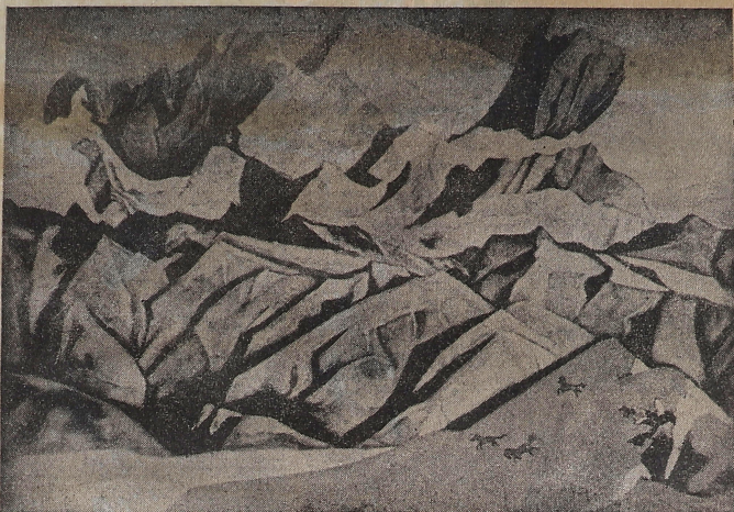
Painting by Prof. Nicholas Roerich whose 90th birth anniversary is being celebrated this week.