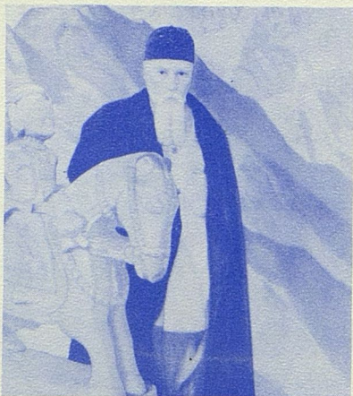
Prof. Nicholas R o e r i c h ( 1874 - 1947 ) Portrait by his son, Svetoslav Roerich