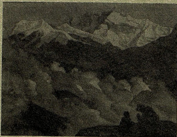
PEARL OF SEARCHINGS BY NICHOLAS ROERICH